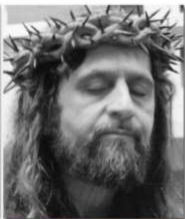
INRI CRISTO in the center of Curitiba in front of the Avenida Palace (1993)