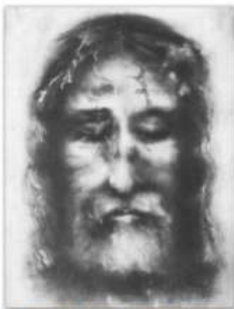
True copy of the Shroud provided by the French branch of SOUST